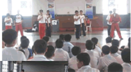
Paclilbar Bicol Arnis